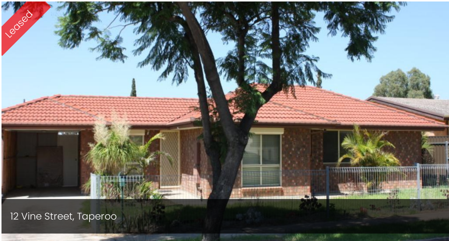
12 Vine Street, Taperoo