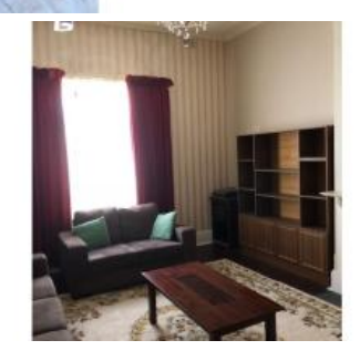
≜4 ≞1 ⇔1