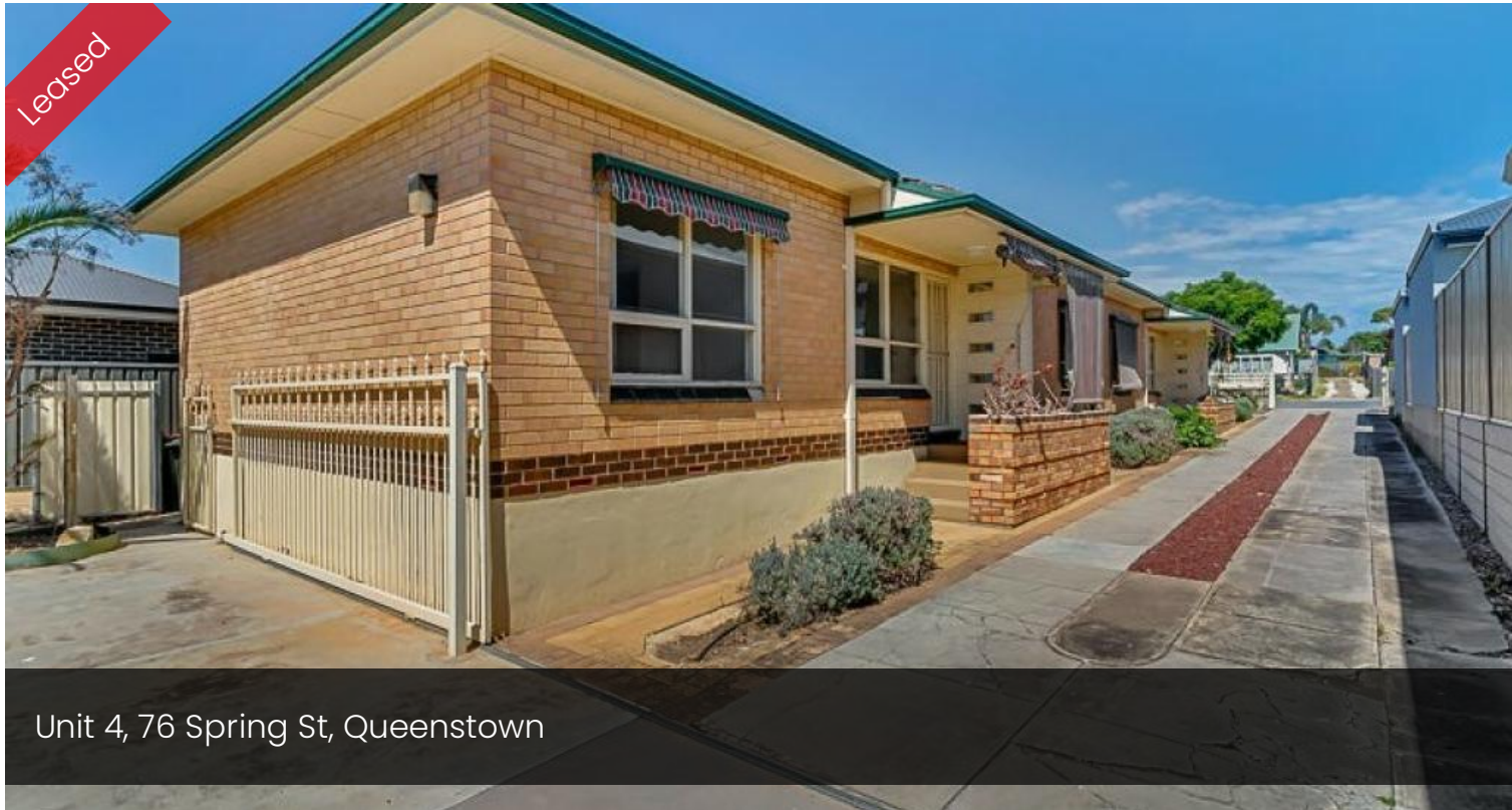
Unit 4, 76 Spring St, Queenstown