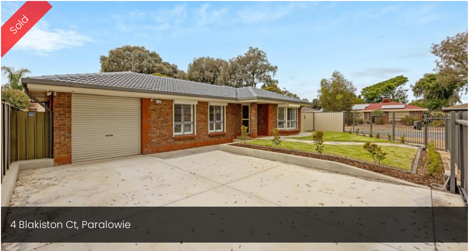
4 Blakiston Ct, Paralowie