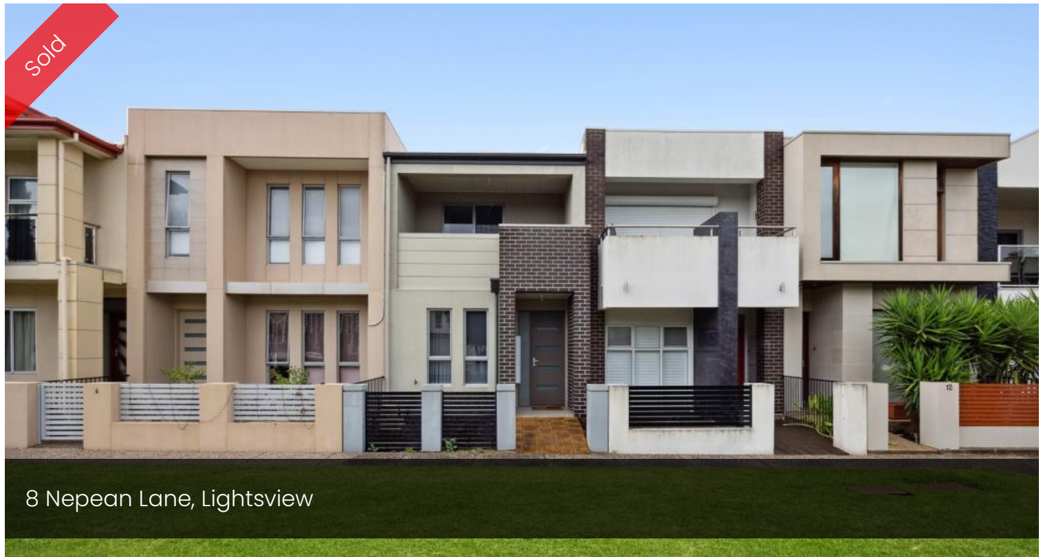
8 Nepean Lane, Lightview