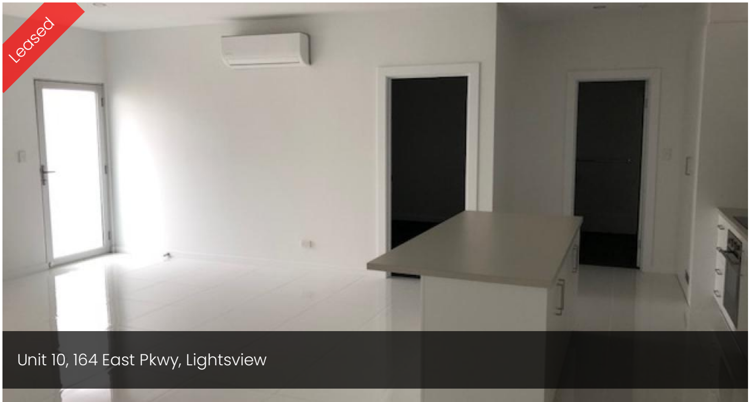
Unit 10, 164 East Pkwy, Lightview