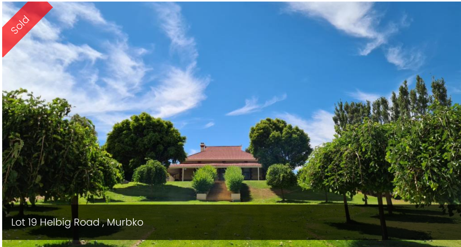
Lot 19 Helbig Road , Murbko