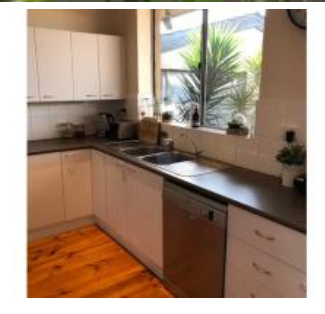
₿3 № 2 № 2