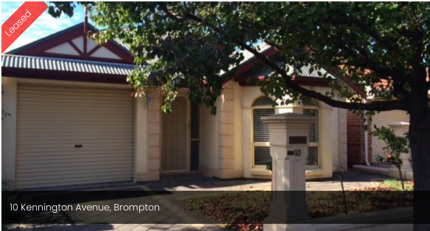
10 Kennington Avenue, Brompton